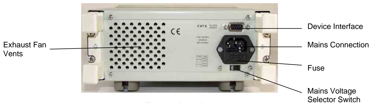
Figure 6: Rear View

The fuse can be easily replaced with the help of a screwdriver. Utilized fuses must comply with the specifications printed on the device (230 / 115 V AC).