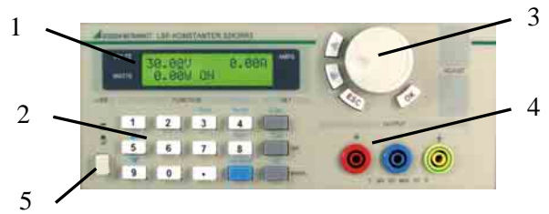
Figure 2: Front View