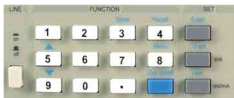
Figure 4: Keypad

In the setting mode, the keys execute the input prompts which are printed in black. In the special mode, they execute the input prompts which are printed in blue.